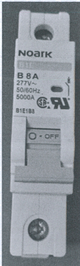
Images of B1 Series